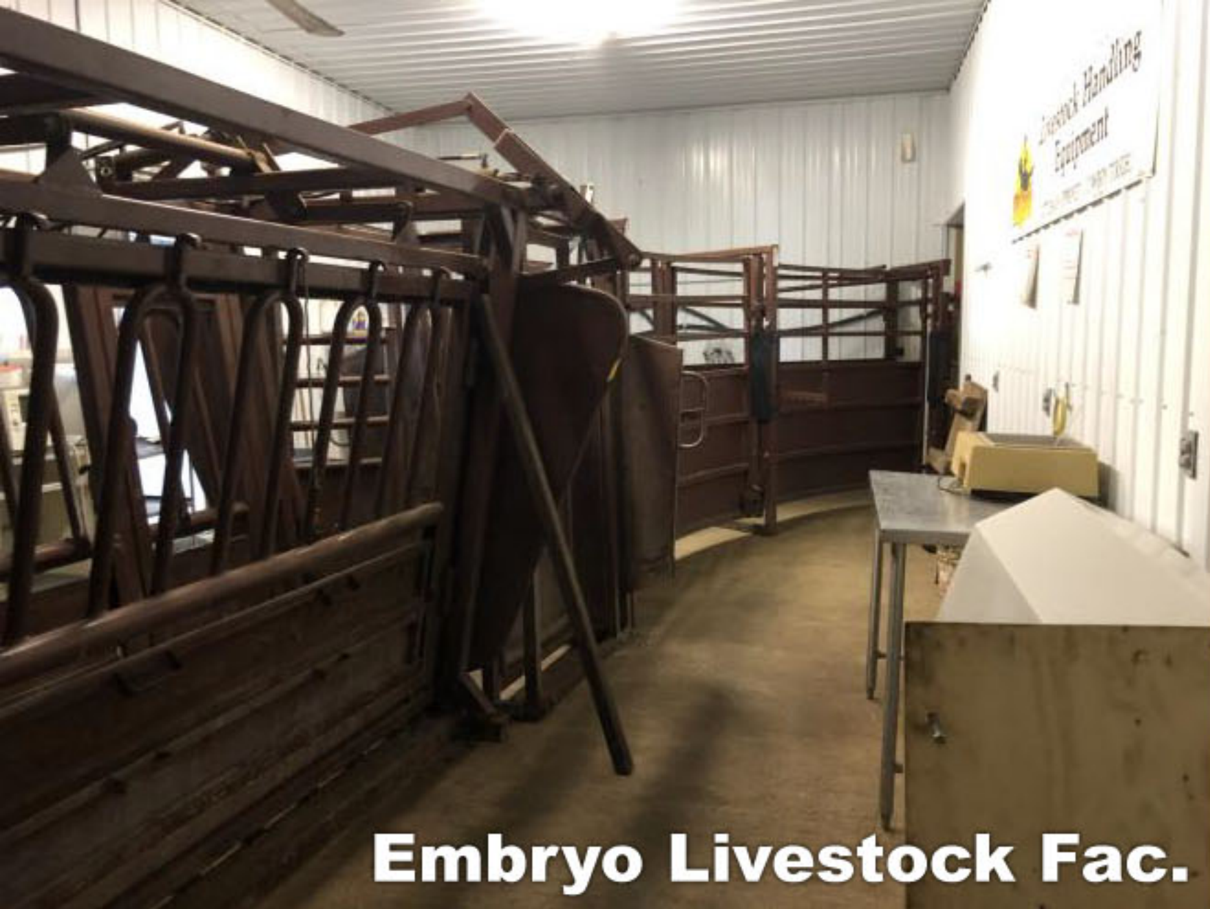
Embryo Livestock Fac.