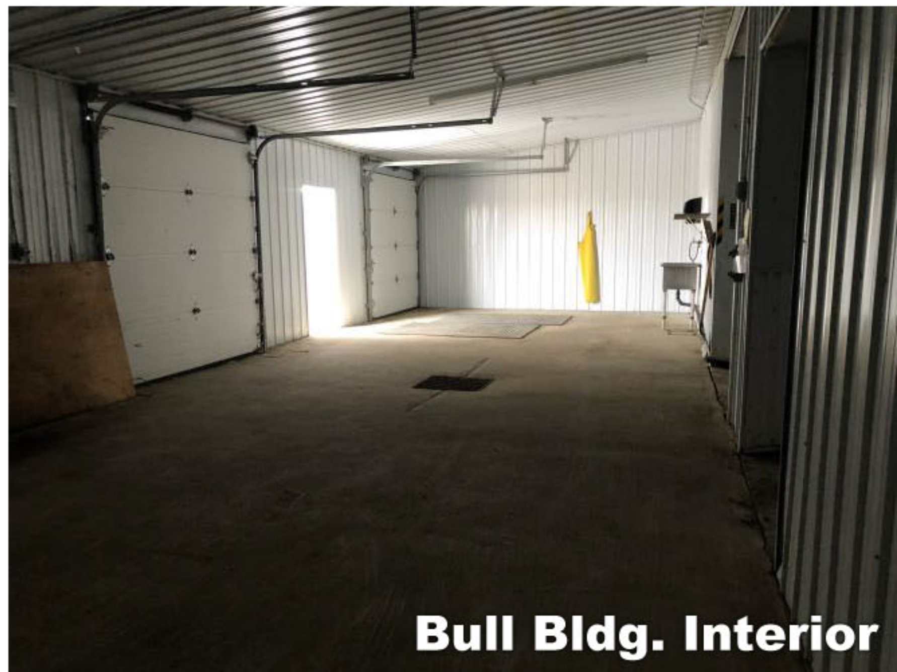
Bull Bldg. Interior