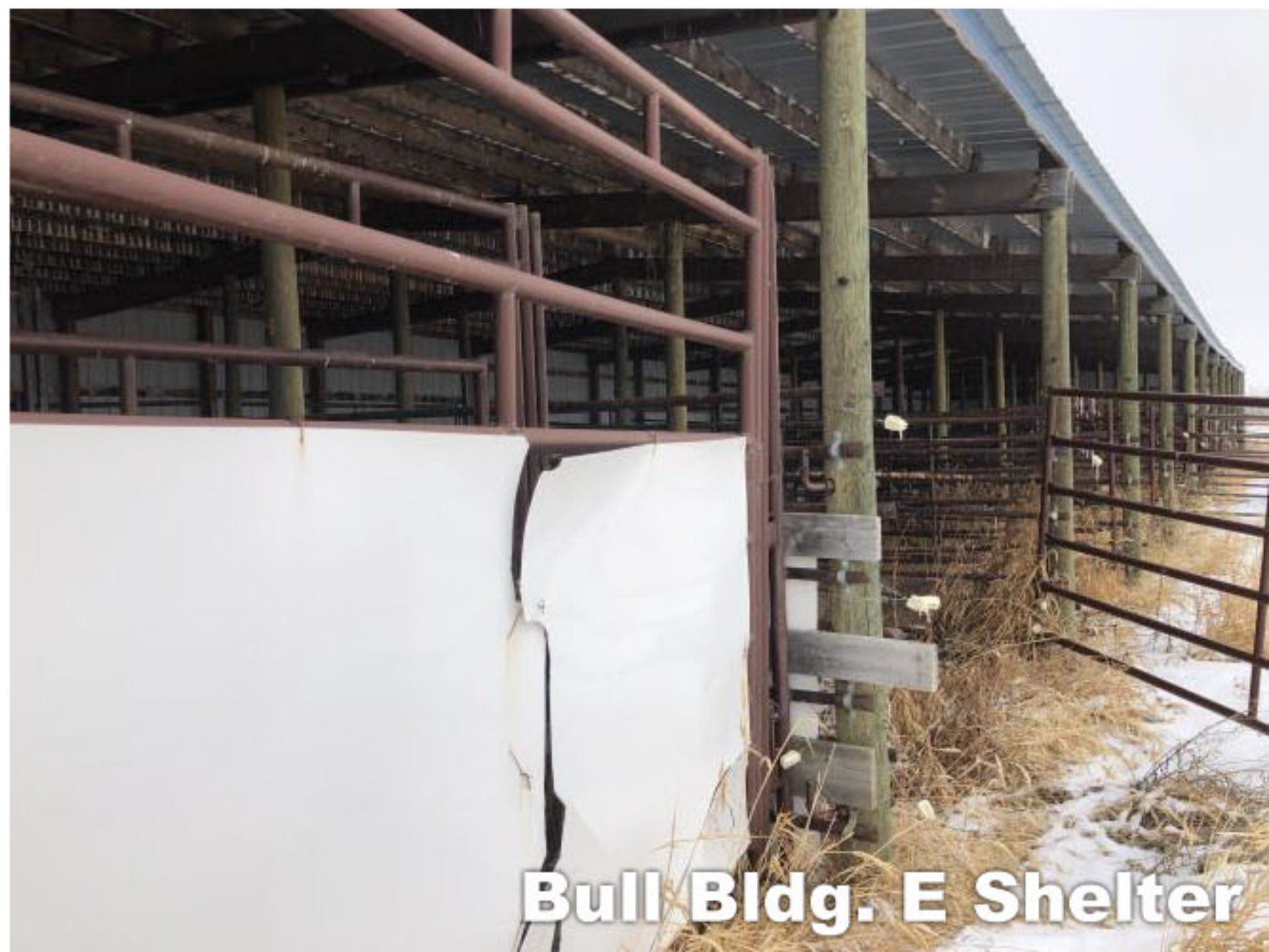
Bull Bldg. E Shelter