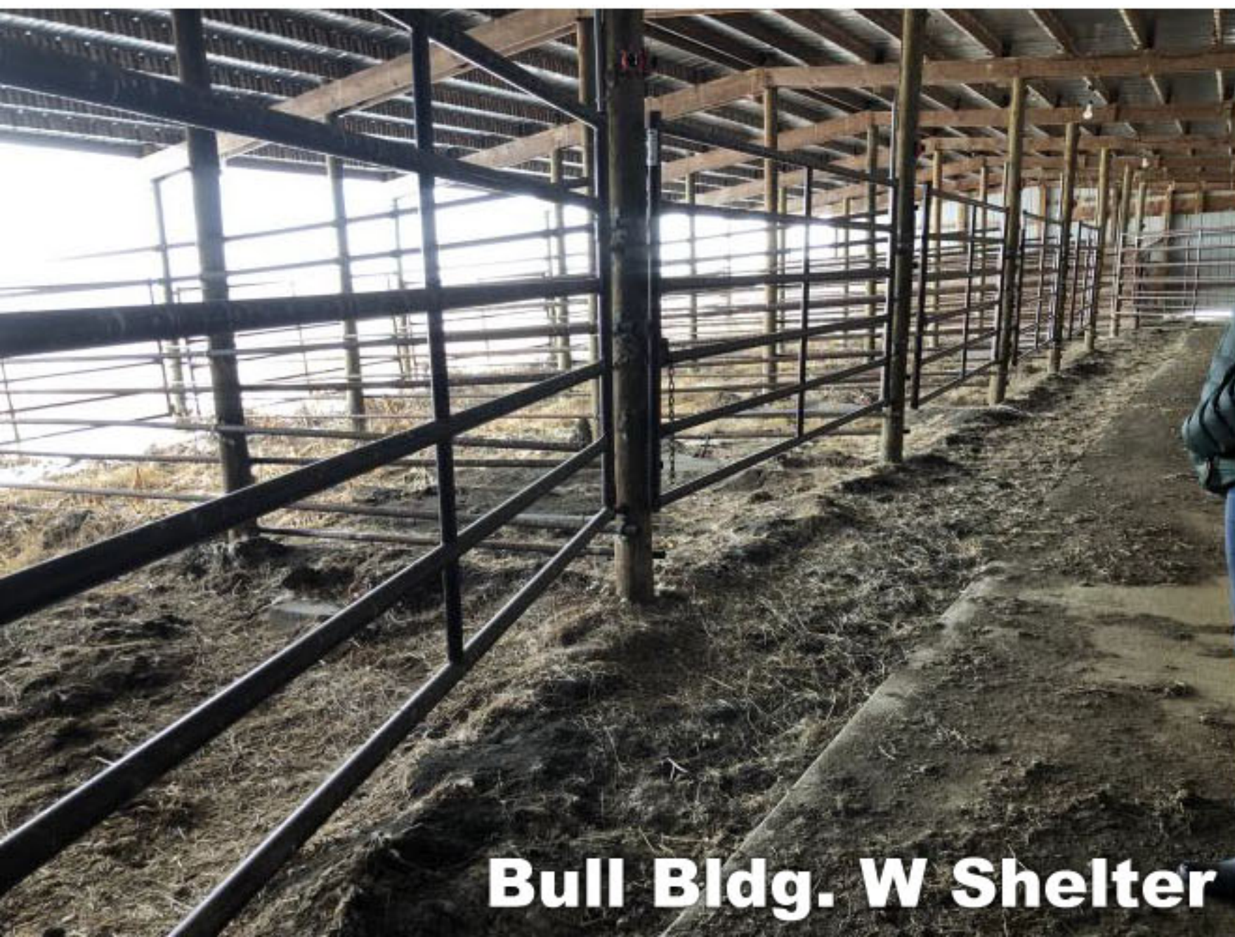
Bull Bldg. W Shelter