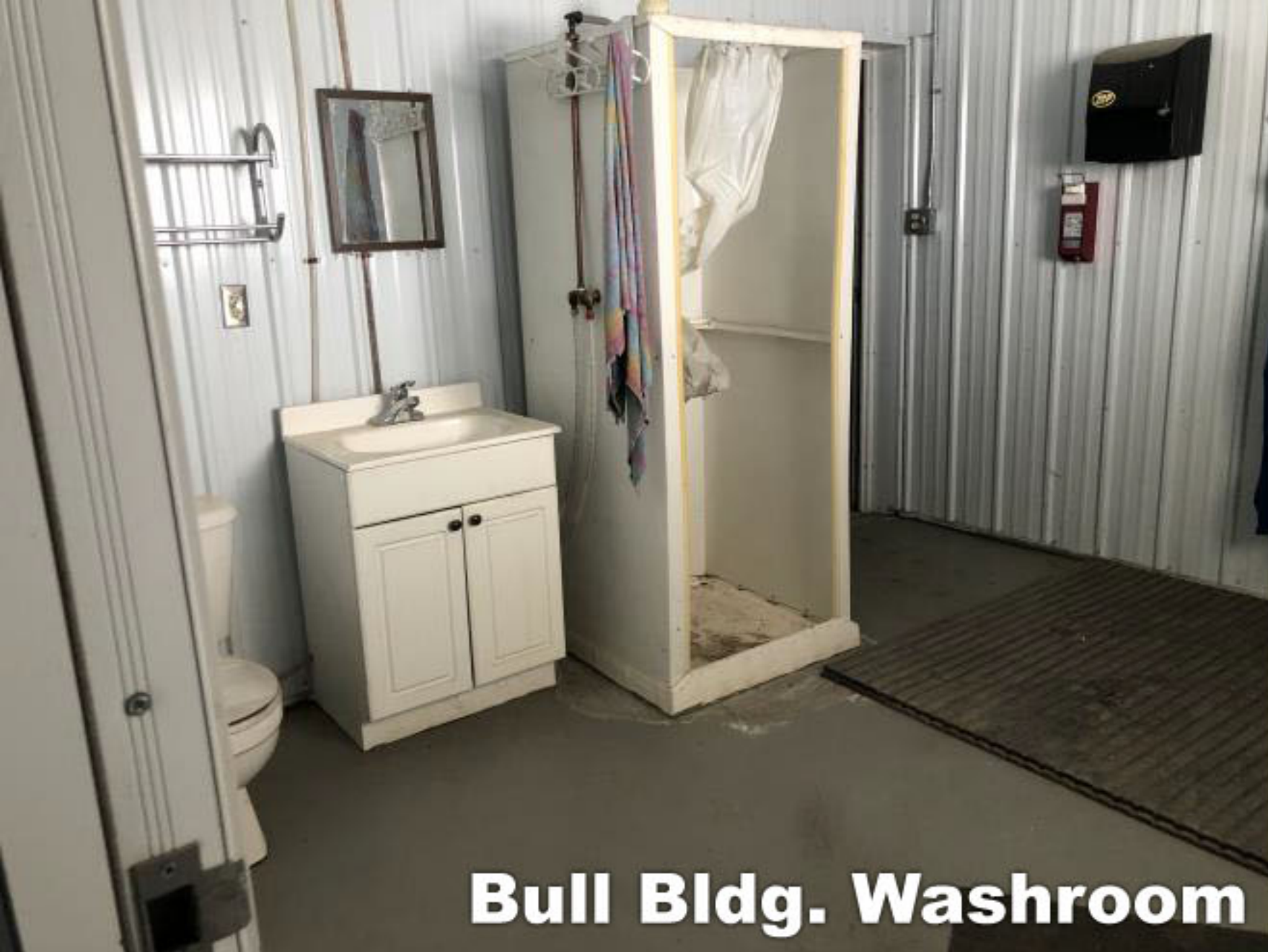
Bull Bldg. Washroom