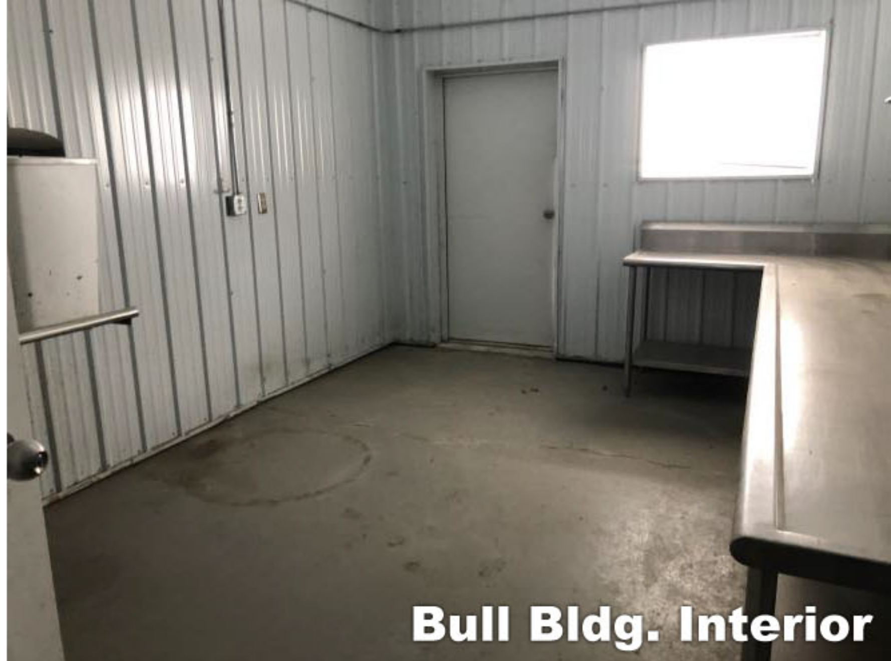
Bull Bldg. Interior