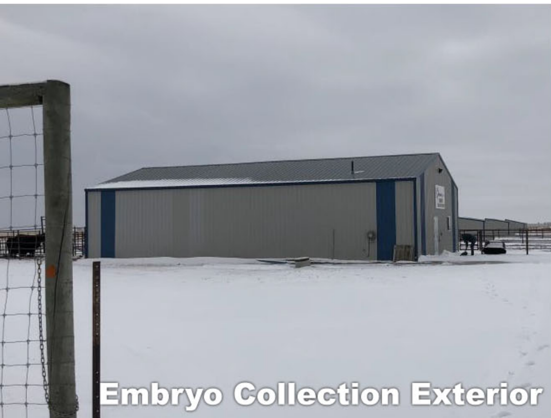
Embryo Collection Exterior