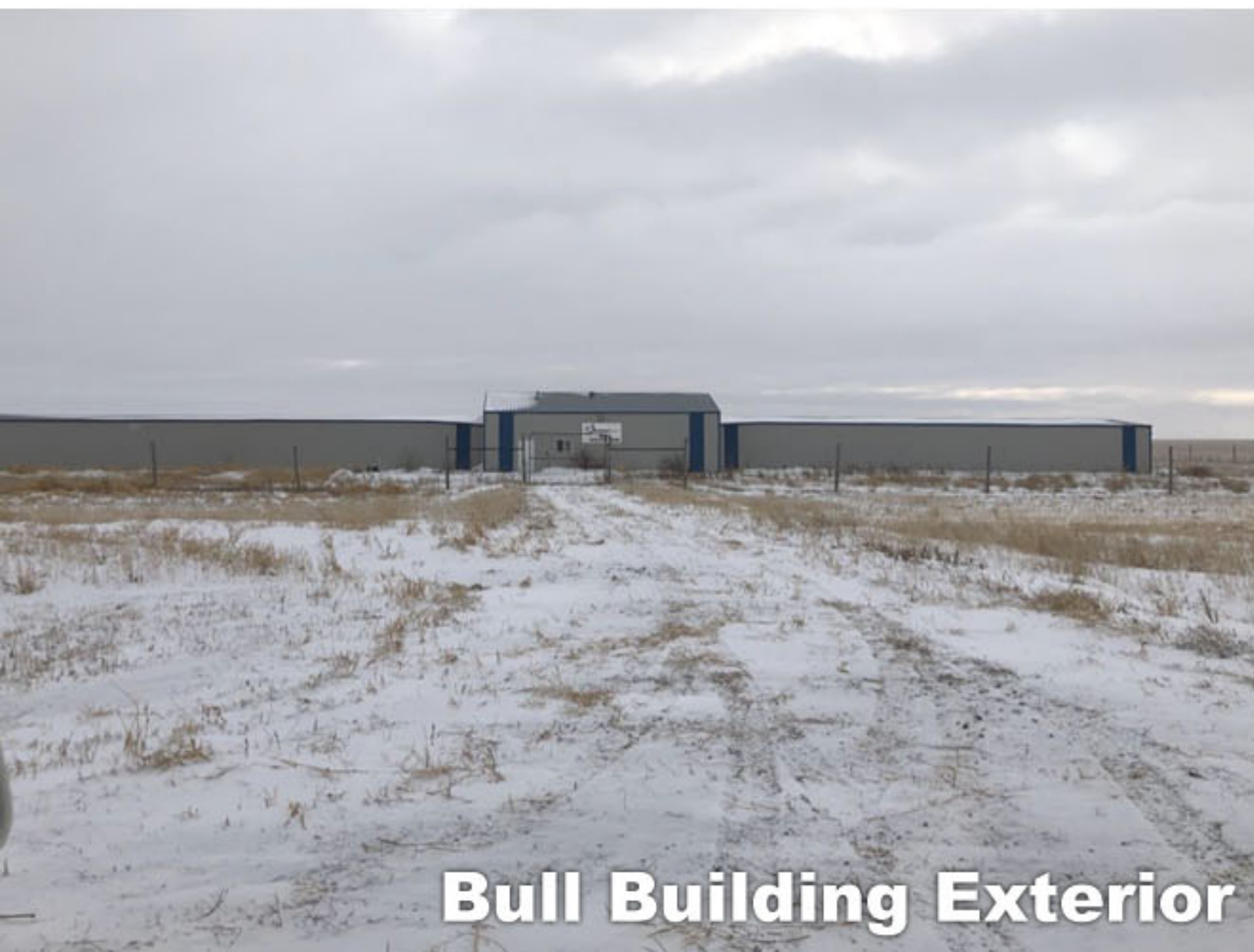
Bull Building Exterior